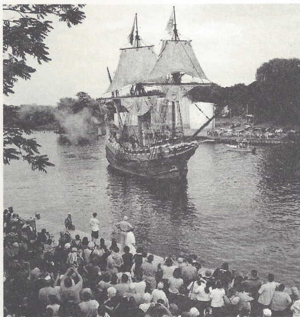
The Half Moon at Rondout , June 10th 2009