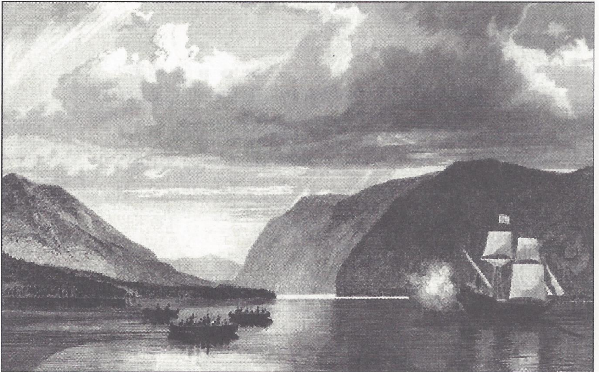
The Half Moon, from a program of the 1909 Hudson-Fulton Celebration.