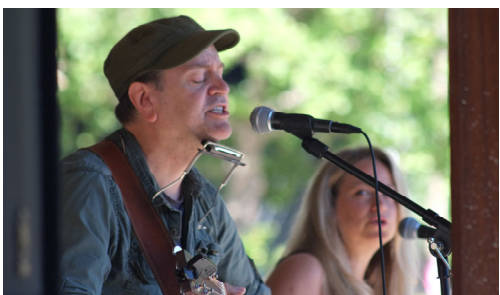
Local band Payne's Grey Sky performing