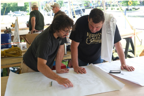
Team Keegan Ales studies the plans

Did you miss the fun this year? Mark your calendars for next year! Saturday, June 23, 2018!