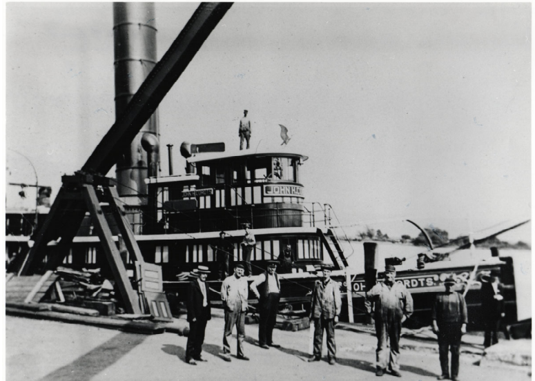
Photo of the Cornell tug John H. Cordts at Cornell Steamboat Company docks with crew members and Cornell shop workers.

Rondout, the port of Kingston, was a major shipping point, and the busiest port on the Hudson for most of the 19th century (1800s). The major product shipped from Rondout was coal brought here from eastern Pennsylvania over the Delaware & Hudson Canal from 1828 to 1898. Coal was the main fuel of the steam age of the 19th century, so Rondout boomed from coal transport. Local products also shipped from Rondout during the same time were Ulster County bluestone shipped widely for use as sidewalks; Rosendale cement, a sturdy natural cement used in building New York City; and bricks from local brickyards also used to build New York City. Ice cut from the Hudson River was shipped to New York City on barges to be used for food preservation. Food products were also shipped, including grain from the Midwest brought to the Hudson over the Erie Canal,