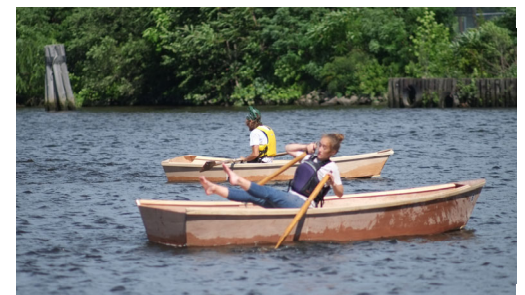
There goes an oar lock!