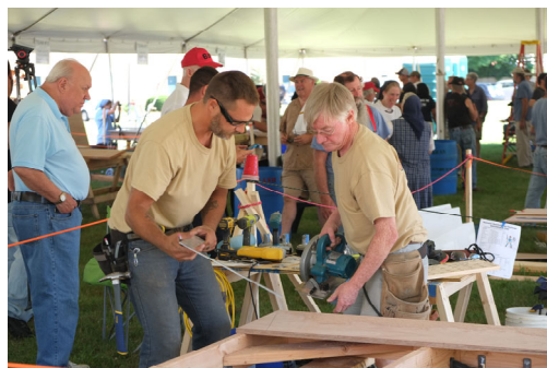
Team Rifton Rascals hard at work!