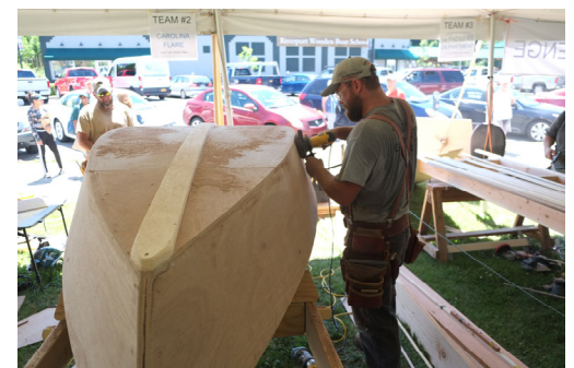
Team Carolina Flare ahead of the pack