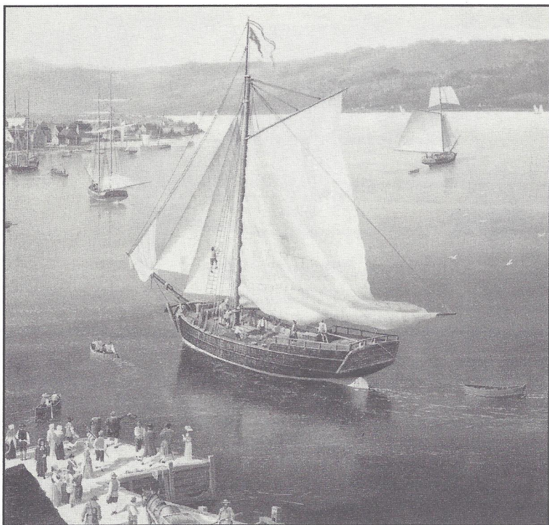
The Sloop Experiment

Detail from the painting The Return of the Experiment by L.F. Tantillo