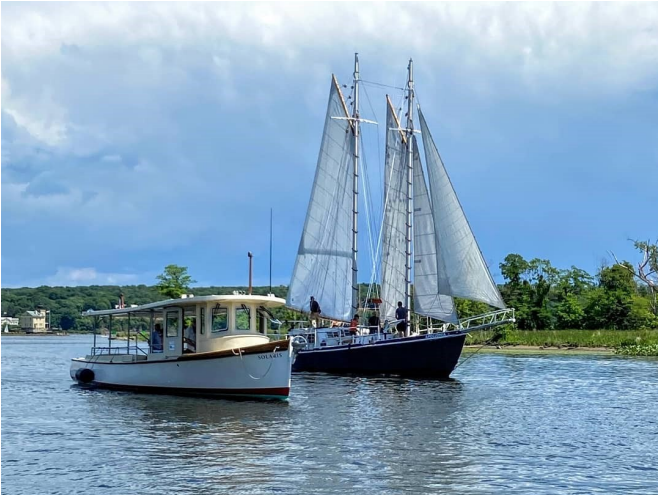
Solaris and Apollonia on the first day of the RiverWise: South Hudson Voyage in August, 2020.

This season the solar powered Solaris and sailing vessel Schooner Apollonia embarked on a two-part 145-mile carbon neutral voyage from Albany to NYC, giving rise to the new Hudson River Maritime program RiverWise. This trip harnessed the power of the sun and the wind in an environmentally conscious program. As anyone who has had the pleasure of being a passenger on Solaris or Apollonia knows, these are boats that move in harmony with natural forces. We