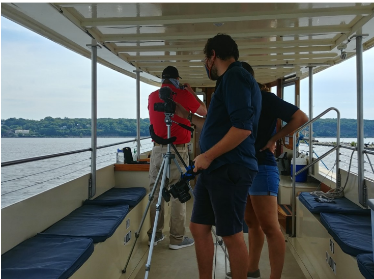
Some of our filmmaking crew aboard Solaris for RiverWise: South Hudson Voyage.

As many of you know, one of our RiverWise journey goals was to collect high quality documentary film footage of the Hudson River and all its engaging and historic people and places. But we're not done yet! We'll be collecting more footage throughout the fall and winter and start turning them into documentary films! We're already planning to release a film about the RiverWise journey itself in December, so watch for announcements of the release date.