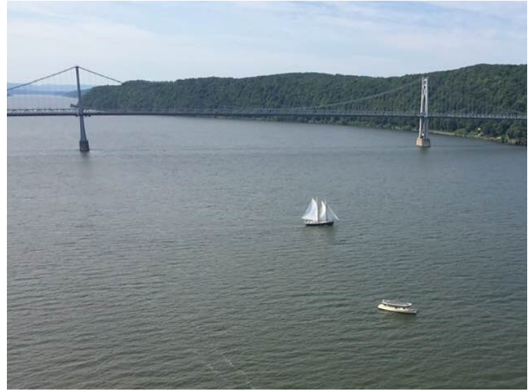
Left: Solaris, Apollonia, and Clearwater rafted up together in Albany in late June on the RiverWise: North Hudson Voyage. Right: Solaris and Apollonia pass the Mid-Hudson Bridge in August on the RiverWise: South Hudson Voyage.