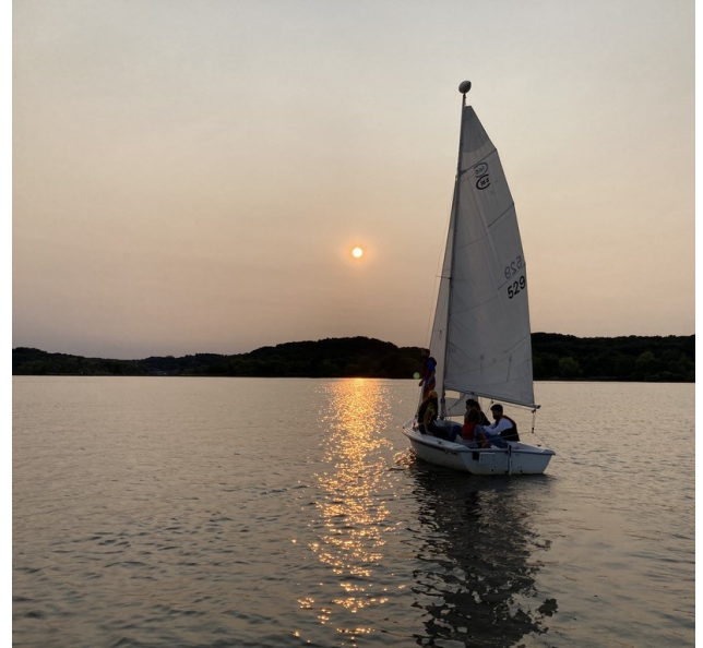
Sailing into the sunset aboard one of our keelboats.

In past years, we have run a large-scale program for our youth sailors, often using more than 10 sailboats each day in our week-long sailing intensive. This year, we held exclusively centerboard classes, with class sizes of three or four students, allowing for social distance and a more individualized experience. Beginner students would sign up for our youth basic class, where they would learn sailing basics with a quick chalk talk, then go out onto the river and sail with an instructor. More advanced students would take clinic classes, where they would get some more water time with the instructor in a nearby safety boat. Our adult classes, previously held exclusively on keelboats, were also held on a centerboard boat and run very similarly to the youth classes, with a maximum class size of three students. The centerboard sailing classes enabled adults to get a close-to-the-water, hands-on experience, including capsizing practice, which set a solid foundation for them to build upon in future centerboard boat and keelboat classes.