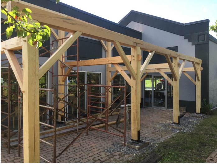
New timber framed structure going up at the Boat School. Learn to timber frame with our Intro to Square Rule Timber Framing class.

There is no question we had a different summer than usual at the Wooden Boat School, but I'm sure everyone else did as well. After postponing and canceling all the summer classes we turned our focus to restoration work. Some of the highlights were finishing up the replacement of the stem and repairing a plank on a 16ft Penn-Yann. Restoring the finish and applying a flawless paint job on a classic wherry and repairing several split planks on a Lawley Tender. The four boats of our wooden Opti fleet that were built in the boat school also got a fresh coat of paint and several coats of varnish. They are now ready for next year's youth sailing program. We currently have a Snekke, built in Norway of Norwegian Pine, under the shed for restoration, and have a few other projects lined up to keep Wayne busy.