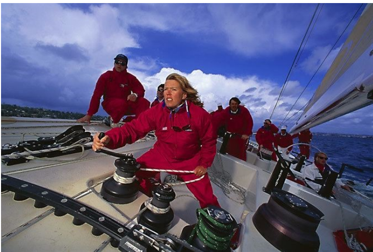
Skipper Dawn Riley during a race.

Originally scheduled for March 30, 2020, the Fourth Annual Women's Sailing Conference was rescheduled for November 6 & 7 and completely sold out. But COVID hasn't given up yet, so we've recently retooled the event as 100% virtual.