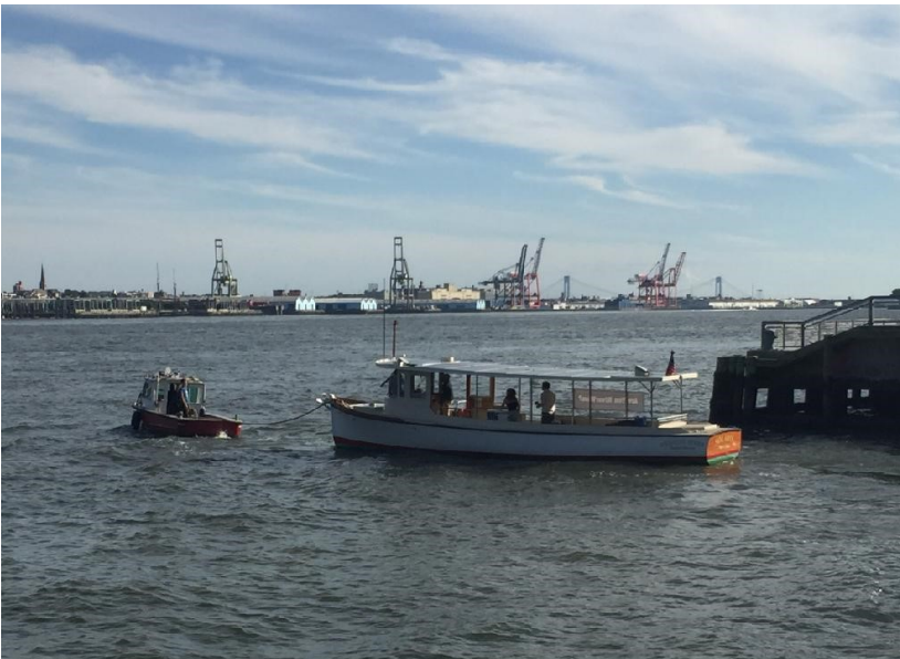
Solaris being towed from South Street Seaport after motor problems during RiverWise: South Hudson Voyage.

This was our second season operating Solaris but due to COVID at times it felt like the first season all over again. With a delayed start to the season, Solaris did not begin regular programming until Mid July. That said, once we began programming we realized just how lucky we are to have an elegant spacious totally open air vessel. As per NYS safety guidelines we operated Solaris at reduced capacity and the reduction in numbers led to a more relaxed and luxurious atmosphere. While on the RiverWise voyage we also experienced some mechanical problems due to a manufacturer defect with our outboard motor. This was luckily still under warranty and so we were able to replace the motor with no further trouble. Even with these