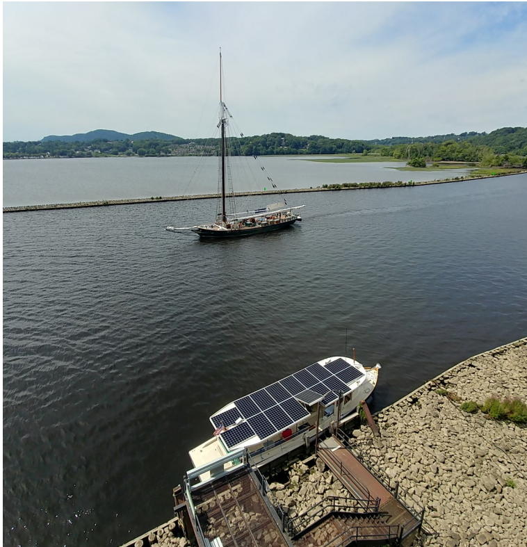
While Solaris was docked at the Rondout Lighthouse in August for filming, we saw our friends aboard the Clearwater headed out of Rondout Creek for a sail!

NONPROFIT ORGANIZATION U.S. POSTAGE PAID NEWBURGH, NY 12550 PERMIT NO. 8604